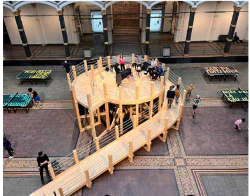
untitled 2024 (demo station no. 8), 2024 , installation view, “Rirkrit Tiravanija: DAS GLÜCK IST NICHT IMMER LUSTIG,” Gropius Bau, Berlin, 2024

Structured like a single-story house, the installation is designed as a space for viewing and rest. It references the Kings Road House, designed in 1922 by Austrian architect Rudolf Schindler (1887–1953) in West Hollywood, Los Angeles. The house was conceived as a shared home for two families (the architect's family and a couple of friends), a design vision that challenged the traditional domestic model. Tiravanija presents a wooden replica of the part of the house used as a studio and invites visitors to pause and watch four of his films—most of which were made in collaboration with other artists—that explore recurring themes in his art, such as dialogue, everyday life and community dynamics. In its first presenta-