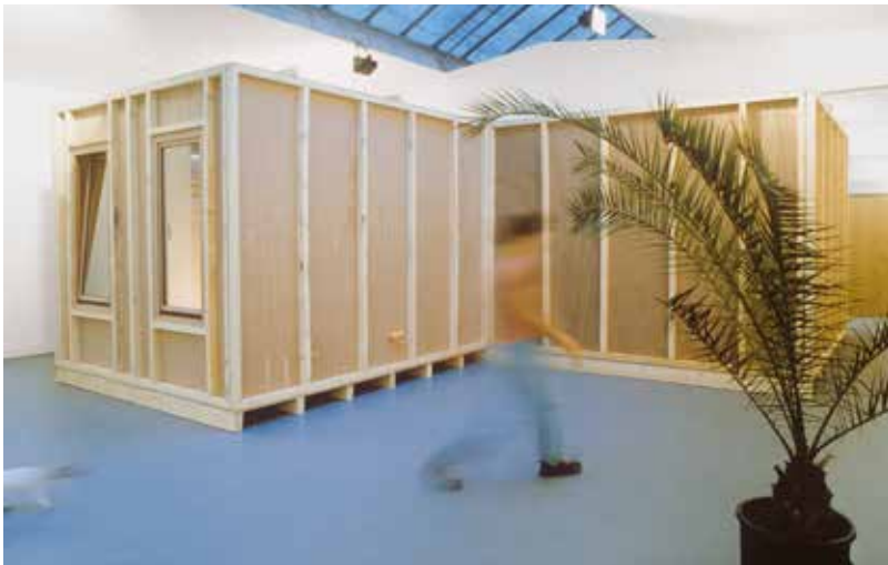
untitled 1996 (tomorrow is another day) , 1996, installation view, Kölnischer Kunstverein, Cologne, 1996