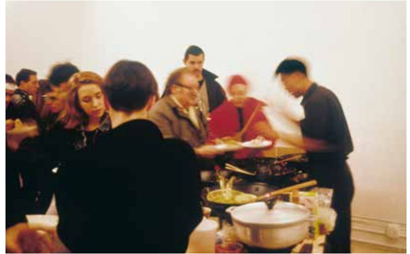
untitled 1990 (pad thai) , 1990, during the opening, Paula Allen Gallery, New York, 1990

Based on these reflections, Tiravanija created untitled 1987 (text in red and black) (1987), in which the artist placed a text on the wall of the university art gallery as a direct and provocative request for restitution: «We demand the return of our cultural artifacts in the museum of the Art Institute of Chicago, otherwise we will blow it up.» Over the following years, this inquiry translated into a body of work that directly challenged museum conventions—from exhibition design to the organization and transmission of knowledge. The aim shifted from simply exposing mechanisms of value attribution to restoring objects to their original sphere of use and relations. An emblematic example is untitled 1990 (pad thai) (1990), created for Tiravanija's first solo exhibition at Paula Allen Gallery in New York. During the opening, the artist