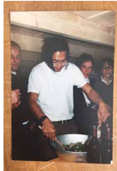
Rirkrit Tiravanija during the opening of the show “Dom-Ino,” Galerie Chantal Crousel, Paris, 1998

Published in spring 2026, the volume dedicated to the exhibition is available at the Pirelli HangarBicocca bookshop and online.