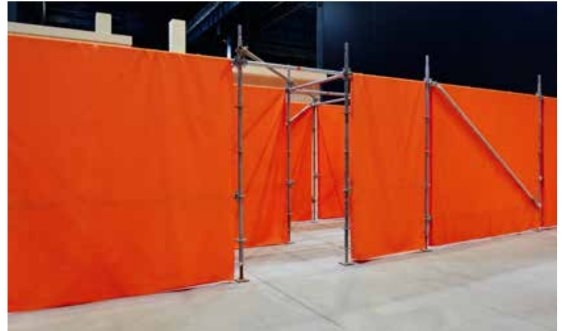
Detail of the maze in the show “The House That Jack Built,” Pirelli HangarBicocca, Milan, 2026.

Entering the Cubo visitors encounter the final work on display, untitled 2009 (the house the cat built) (2026), a replica of Tiravanija’s Thai home, which houses not only his video untitled 2008 (gatos