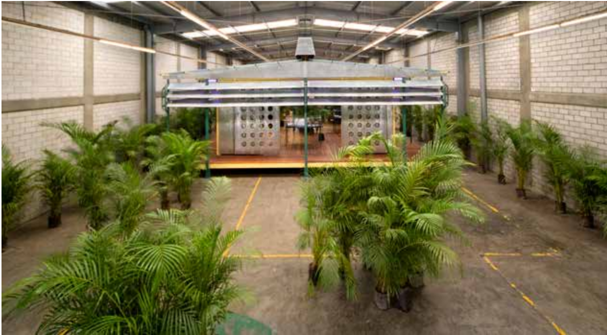
untitled 2006-08 (palm pavilion), 2006–08, installation view, kurimanzutto, Mexico City, 2008

Finally, in untitled 2026 (pavilion, table and puzzle representing the famous painting by Delacroix La Liberté Guidant le Peuple , 1830) (photocopy) , the artist transforms a table designed by Prouvé into a roof beneath which visitors are invited to piece together a black-and-white jigsaw puzzle depicting the famous painting Liberty Leading the People (1830) by French artist Eugène Delacroix (1798–1863).