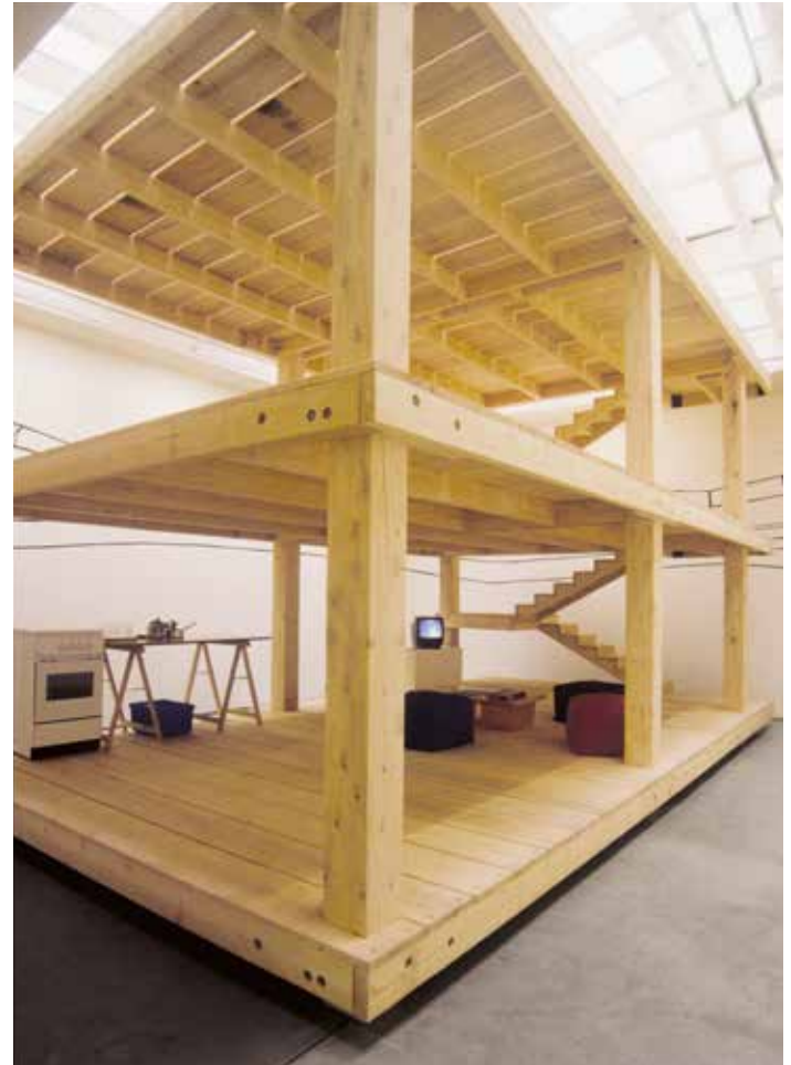
untitled 1998 (dom-ino) , 1998, installation view, “Dom-Ino,” Galerie Chantal Crousel, Paris, 1998 Courtesy of the artist and Galerie Chantal Crousel. Photo Florian Kleinefenn

Play with the board games and tablefootball.