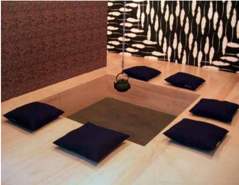
untitled 2009 (the house the cat built), 2008–09 (detail), Galeria Salvador Díaz, Madrid, 2009