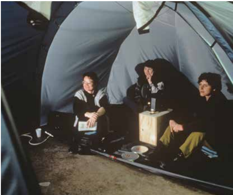
untitled 1997 (cinéma de ville, berlin-bangkok), 1997, installation view, Akademie der Künste, Berlin Biennale, 1998

footage of buildings, streets, and people, focusing on the details of everyday life. untitled 1998 (cinéma de ville) , on the other hand, features a projection of skateboarders photographed in Paris in 1998 in the large square between the Musée d'Art Moderne de la Ville de Paris and the Palais de Tokyo, a space for social and recreational activities.