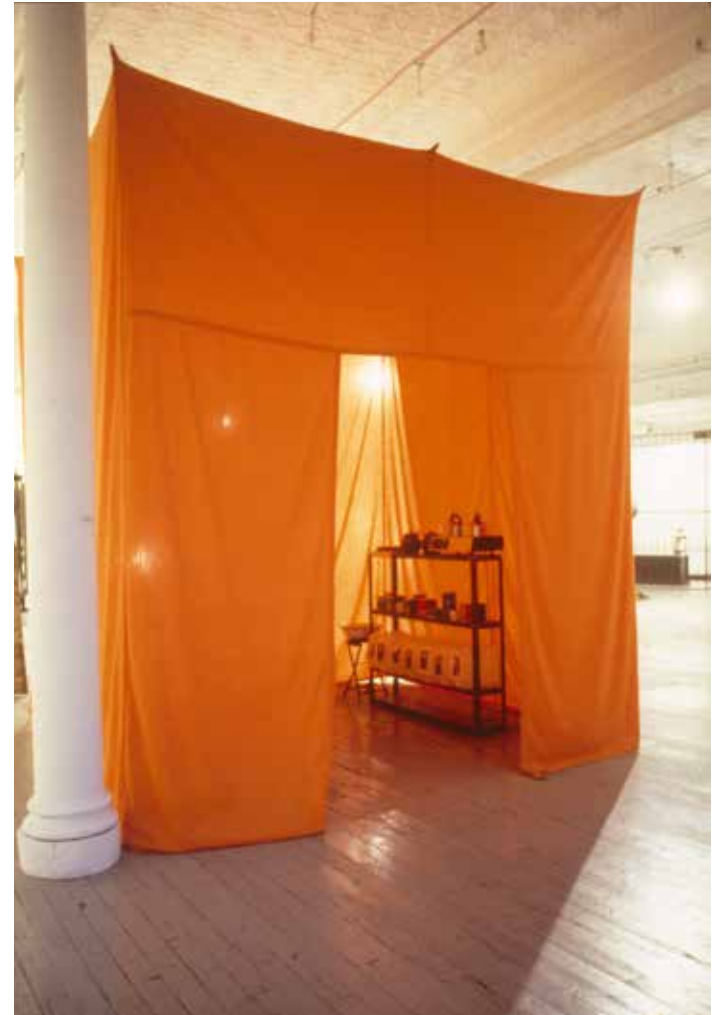
untitled 1992 (cure) , 1992, installation view, "Fever," Exit Art, New York, 1992

In untitled 1997 (cinéma de ville, berlin-bangkok) , two films projected into two tents show Berlin and Bangkok in the mid-1990s, documenting the cities' rapid change with Super 8