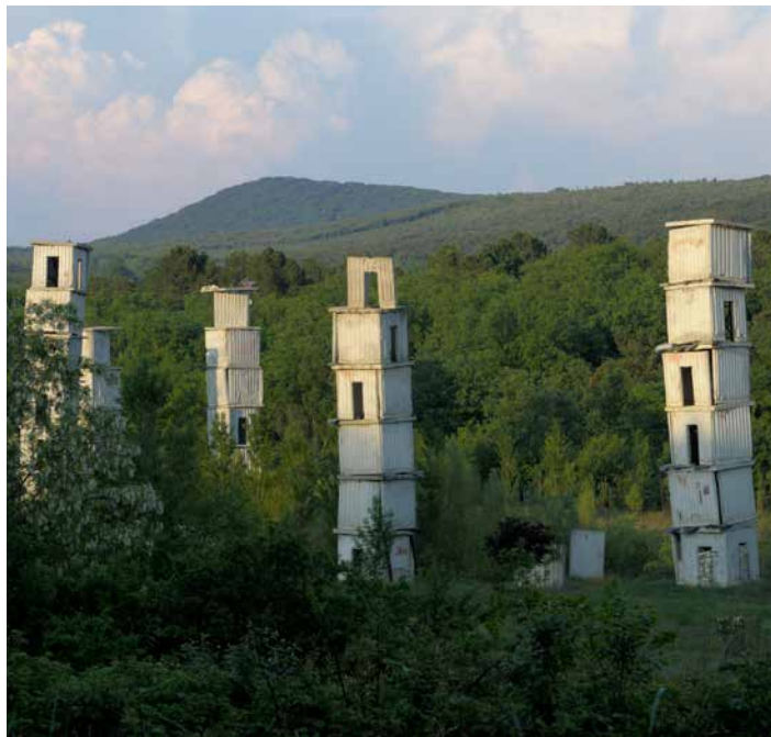
La Ribaute, Barjac, 2011