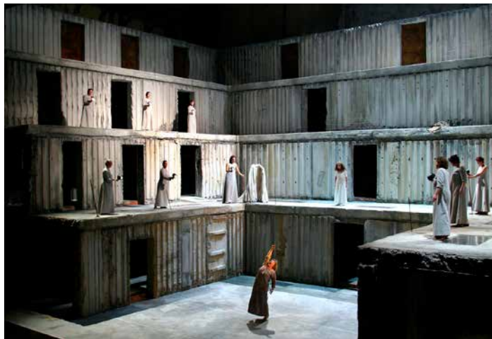
Set design for Richard Strauss' Elektra, Teatro San Carlo, Naples, 2003

Starting in the 2000s, the themes derived from Jewish mysticism took shape in environmental interventions, such as the series Chevirat Ha-Kelim [The breaking of the vessels], a project that Kiefer created at the Chapelle Saint-Louis de la Salpêtrière in Paris. In the same period, he shifted the mystical vision of the “spiritual journey” into a series of paintings inspired by late antique Hekhalot (literally “palaces”) literature, from which Kabbalists derived the notion of the soul’s ascension divided into seven cognitive levels, or seven Heavenly Palaces.