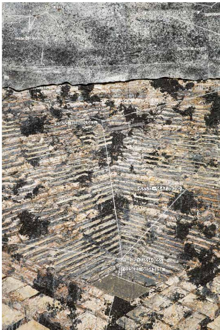
Jaipur, 2009 (detail)