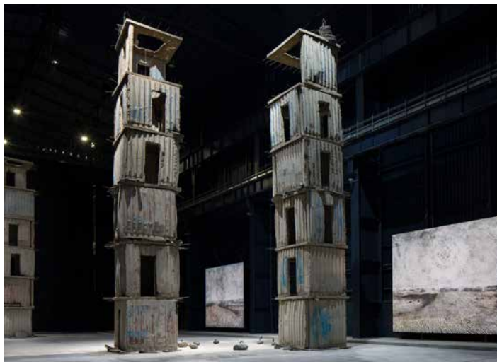
The Seven Heavenly Palaces 2004–2015 JH&WH