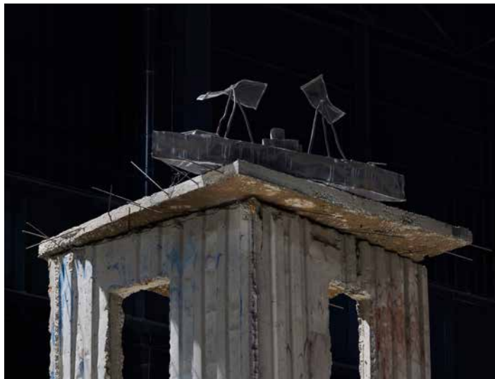
The Seven Heavenly Palaces 2004–2015 Ararat (detail)