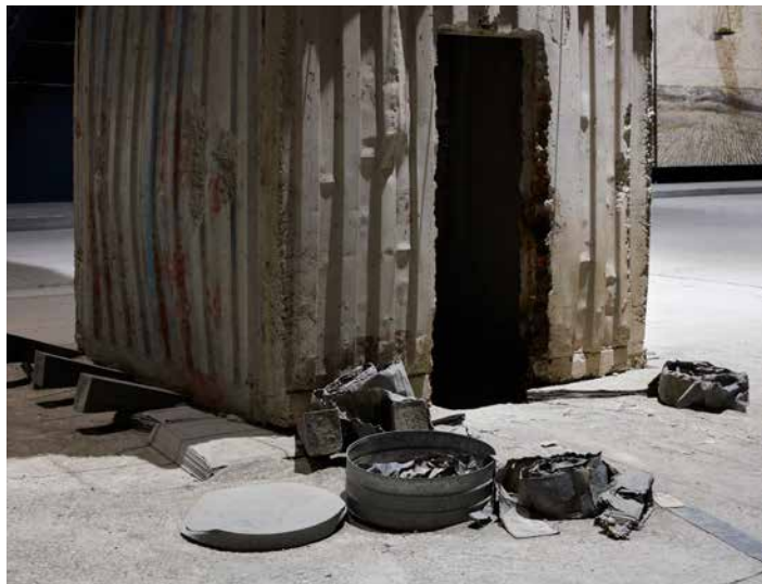
The Seven Heavenly Palaces 2004–2015 Linee di campo magnetico (detail)