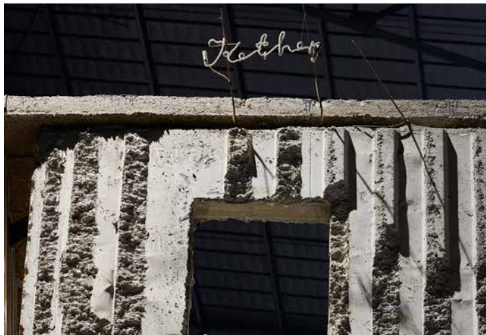
The Seven Heavenly Palaces 2004–2015 Sefiroth (detail)