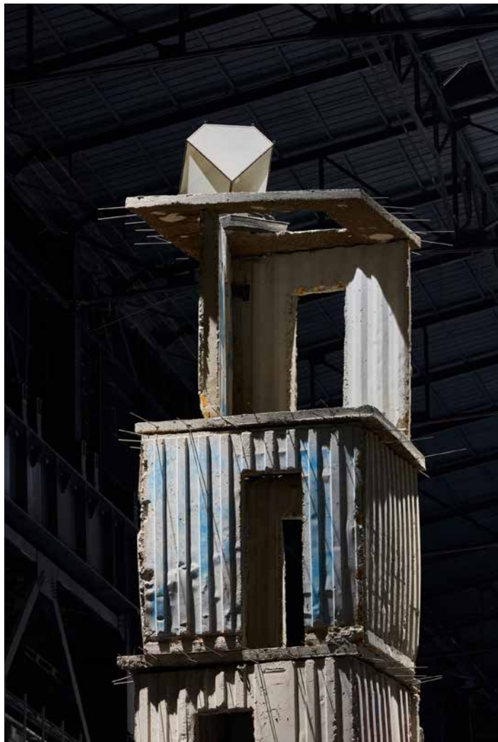
The Seven Heavenly Palaces 2004–2015 Melancholia (detail)