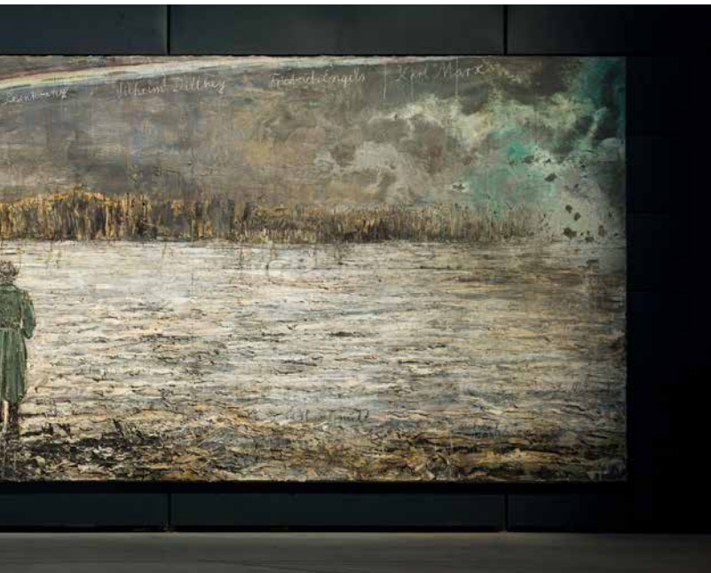
Die Deutsche Heilslinie, 2012–13

Exhibited on two walls of the exhibition space, the five canvases enclose on two sides the area in which the “towers” stand. Displayed on the end side of the area is A Die Deutsche Heilslinie [The German line of spiritual salvation] (2012–13), the largest painting on show, which symbolically and literally portrays the history of German salvation. The artist depicts a man, seen from behind as he gazes a river flowing, a scene that recalls the Wanderer above the Sea of Fog (1818) by the German Romantic painter Caspar David Friedrich (1774–1840). Set on a rainbow trajectory that connects earth and sky and crosses the entire surface, Kiefer transcribes the names of German philosophers who supported the idea of sal-