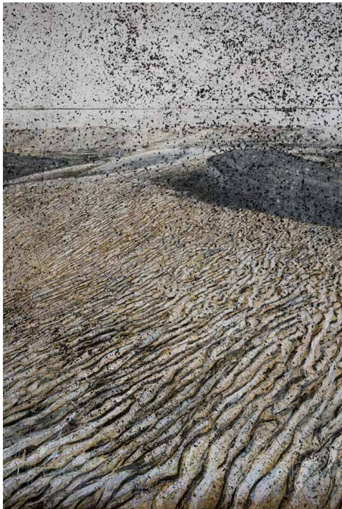
Cette obscure clarté qui tombe des étoiles, 2011 (detail)