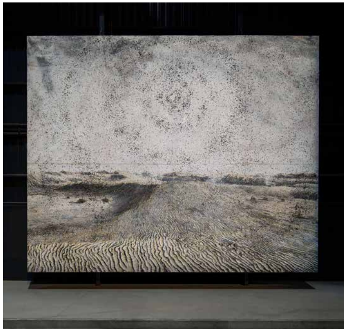
Cette obscure clarté qui tombe des étoiles, 2011

entirely sterile. A “rainfall” of sunflower seeds—recurrent elements in the artist’s practice—is the only sign of life and hope of regrowth. The two canvases are connected through a set of balance scales containing salt on one dish and sunflower seeds on the other: opposed symbols of sterility and fertility. The scales are clear references to the artist’s interest in alchemy, the esoteric science whose purpose was to transform lead into gold, allegory of the transmutation process of an individual’s inner self. The two following paintings are from the series DE Cette obscure clarté qui tombe des étoiles [This dark brightness which falls from the stars] (2011) and depict a desert landscape onto which Kiefer applied black sunflower seeds on a white background, emblematic representation of stars which appear as negative prints.