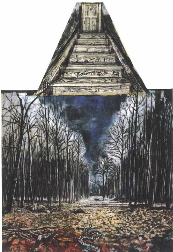
Resurrexit , 1973 Oil, acrylic and charcoal on burlap, 320 x 180 cm Private collection