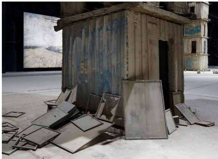
The Seven Heavenly Palaces 2004–2015 Torre dei quadri cadenti (detail)